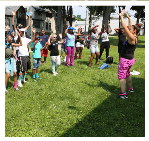
Zumba in Pugsley Park during the Day of Wellness.