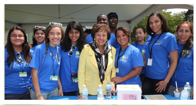
Congresswoman Nita Lowey with HRHCare Outreach Workers.